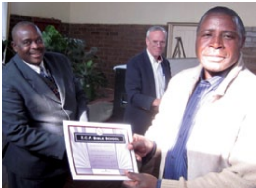
Those who completed four years of attending the Bible school for rural church leaders in Zimbabwe receive their certificates.

The main purpose of my trips to Zimbabwe each year is to conduct a week-long Bible school for rural church leaders in their own languages, the only such training they get all year. During the school, we had intensive lessons on Church History, Church Planting, Doctrines of God and Christ, Leadership Qualities, and an in-depth study of Philippians, using both local and foreign teachers.