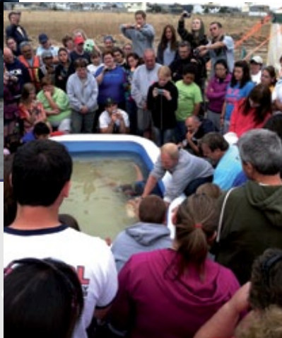
O happy day! The campers shared daily devotions, messages, singing, and talent. Several responded to the invitation to be baptized.