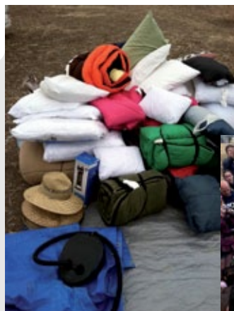
Leaving gifts. When camp broke up, campers donated loads of pillows, sleeping bags, clothes, and shoes to further bless those in need.