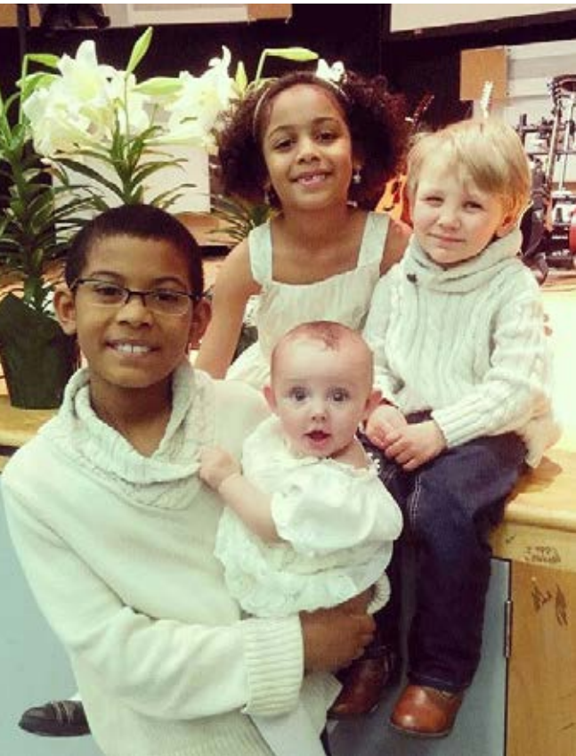
Smith Children, Easter 2016

To read more of the remarkable stories these alumni tell, visit www.macuniversity.edu/alumni .