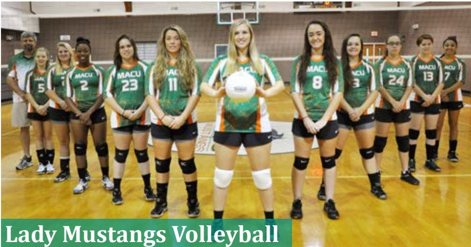
Lady Mustangs Volleyball