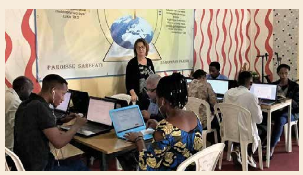
Taking practice tests under lvy's supervision