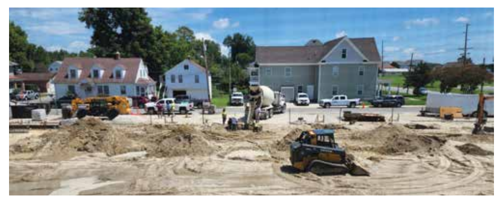
Pouring footers for the new Heritage Hall, August 1, 2022

One of those ways is to look for business partners to join us. We have done that by partnering with Sentara Albemarle Hospital for a $75,000 grant that will help fund the science laboratory equipment inside of our four new laboratories. The laboratories are needed for students in our biology program and related studies. Just this past year, one of our first biology graduates was admitted into a program