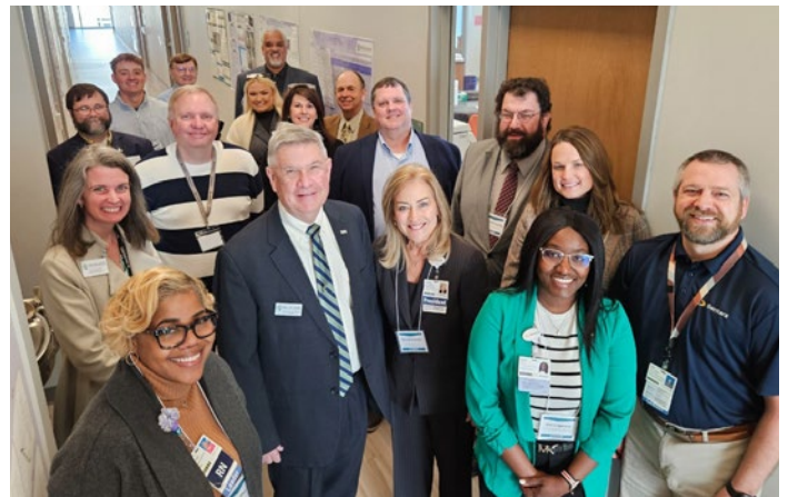
Attendees gather in the hallway outside the lab, located on the second floor of Heritage Hall.