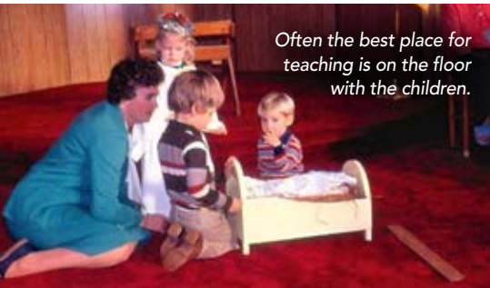
Often the best place for teaching is on the floor with the children.