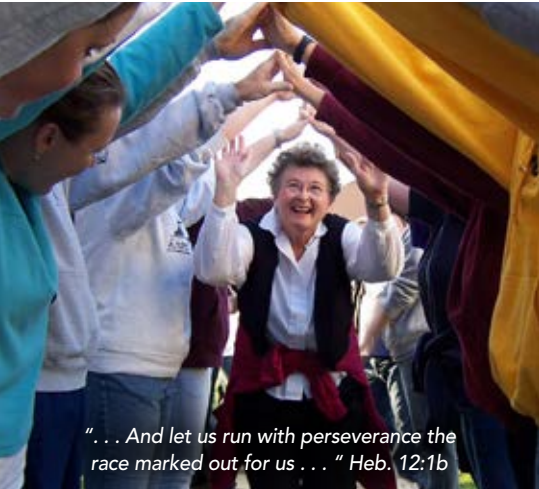
“... And let us run with perseverance the race marked out for us . . . ” Heb. 12:1b