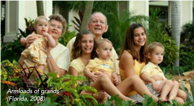
Armloads of grands (Florida, 2008)